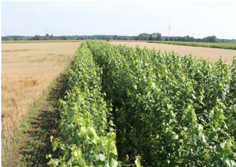
Poplar stripes on arable land (oat left, rye right)